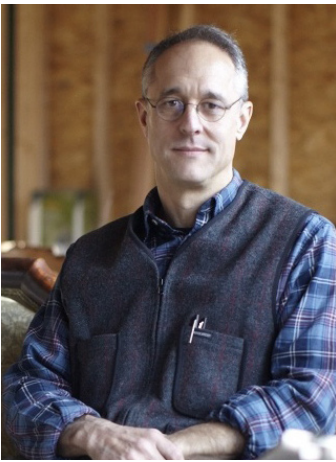
Tenth Anniversary of 9-11 continued from page 1

been handed down from generation to generation to remind us of God's power and faithfulness and to inspire awe and belief within us.